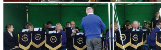
Baxenden Concert Band