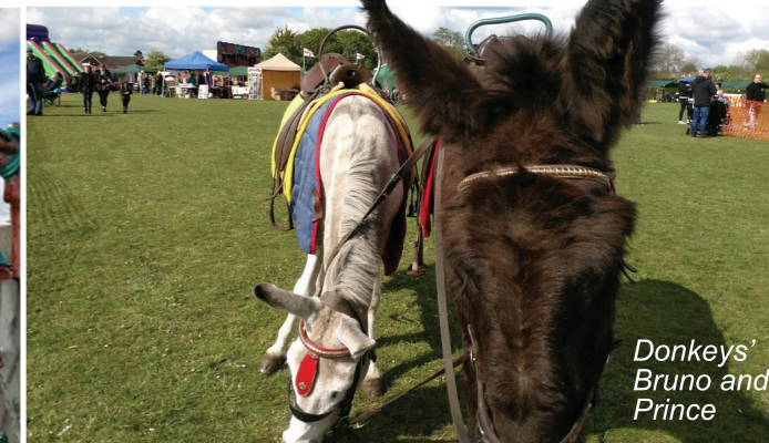
Donkeys' Bruno and Prince